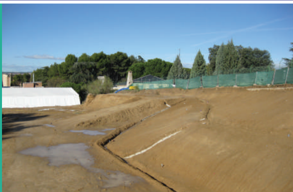
Montecillo after remediation