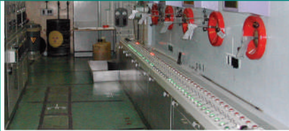
Pilot reprocessing facility before dismantling