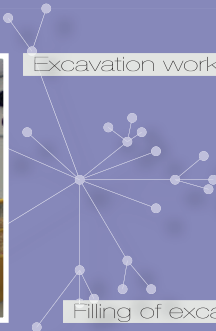
Filling of excavation