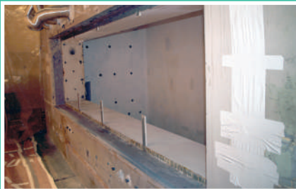
Pilot reprocessing facility during dismantling