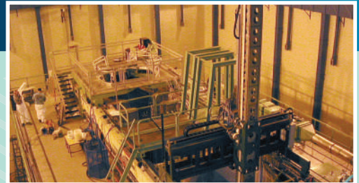
Pool block before and after dismantling