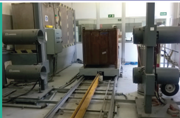
Measurement of clearable materials